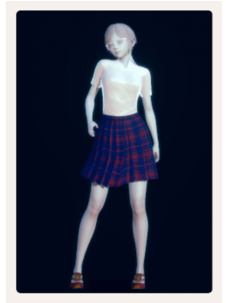
Level 1 - without Overall